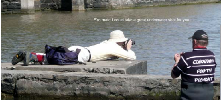
E're mate I could take a great underwater shot for you