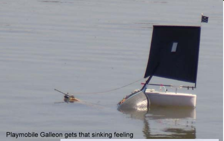
Playmobile Galleon gets that sinking feeling