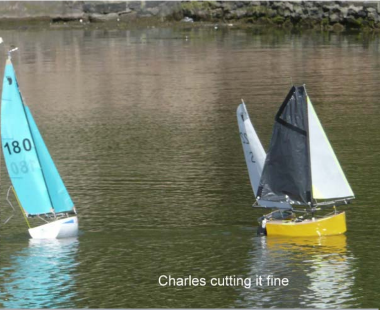
Charles cutting it fine